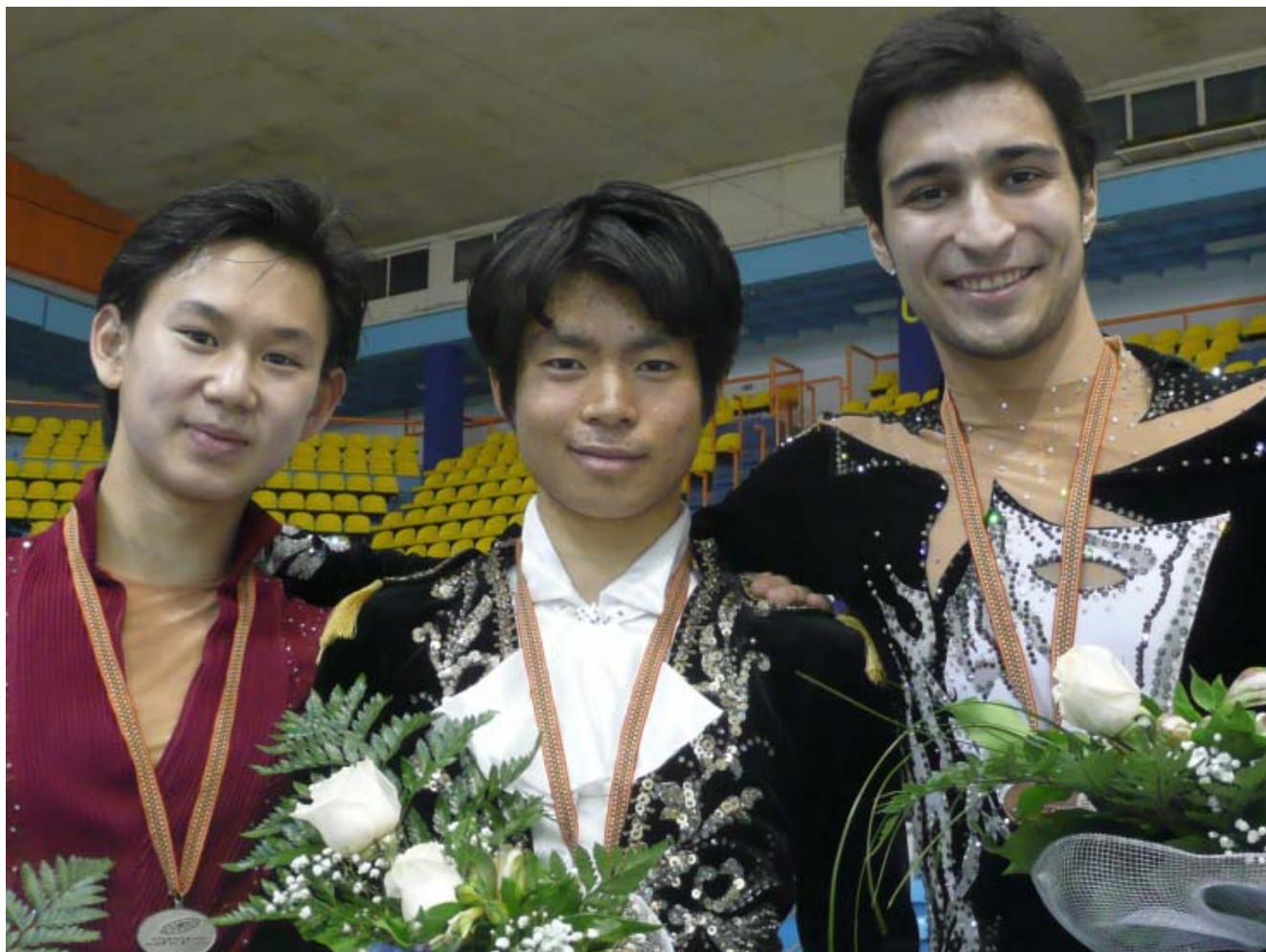
2. Denis TEN KAZ